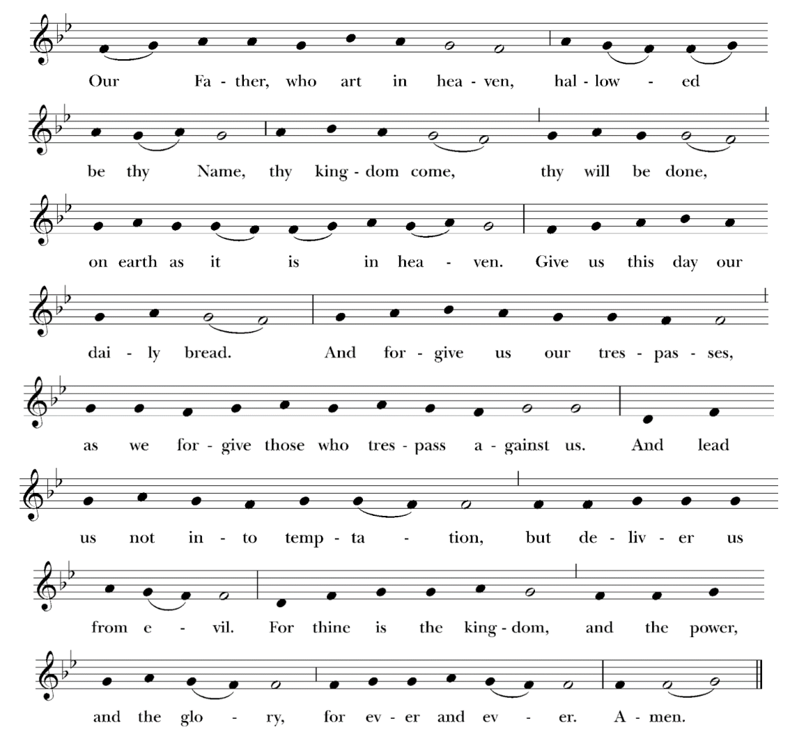
The Breaking of the Bread BCP 364

And now, as our Savior Christ has taught us, we are bold to say,