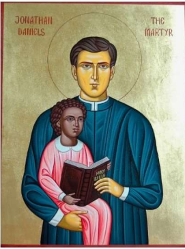
St. Jonathan Daniels felt called to use his gifts for organizing and advocacy. He was martyred on August 20, 1965, when he shielded a group of young people from a shotgun blast. We give thanks for the self-giving love of God evident in his life and work on behalf of others.

There are different spiritual gifts but the same Spirit; and there are different ministries and the same Lord; and there are different activities but the same God who produces all of them in everyone. A demonstration of the Spirit is given to each person for the common good. 1 Cor. 12:4-7